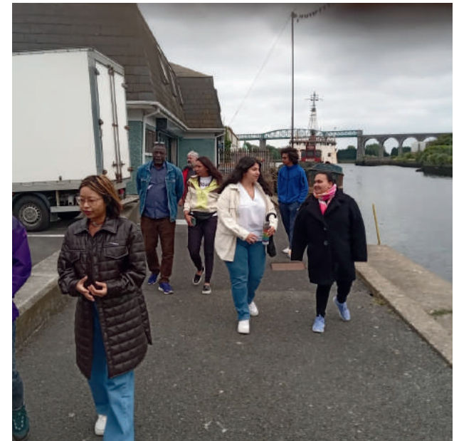
Caption: July 2023, Drogheda. Amplifying Voices.