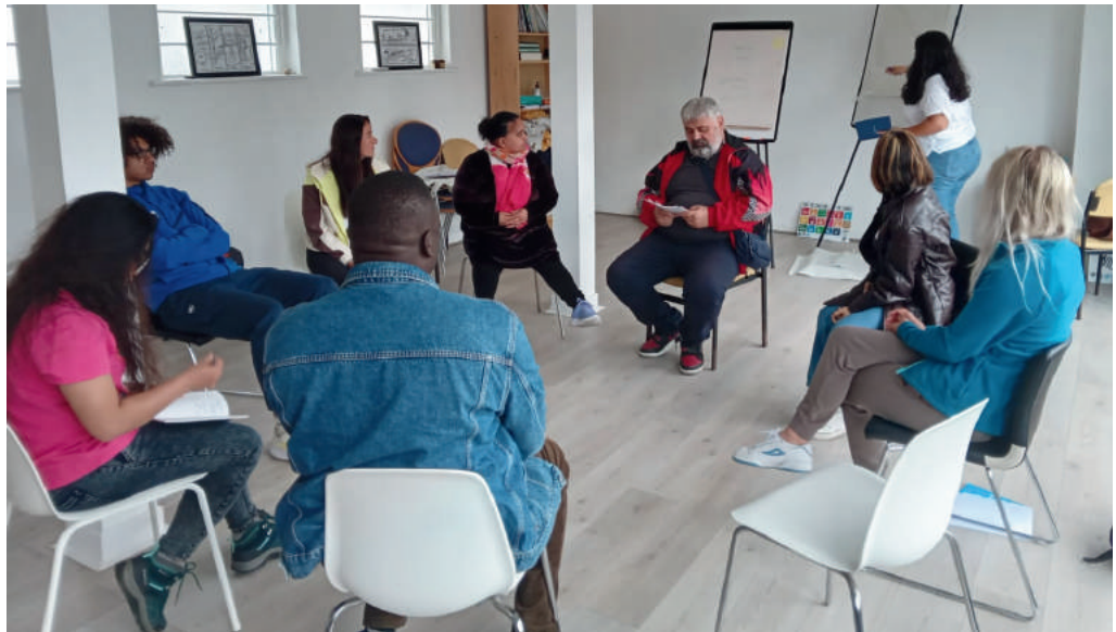
Caption: July 2023, Drogheda. Participants of Amplifying Voices exploring the Hero's Journey.

Having received an Aontas Star award in 2022, Development Perspectives received funding through the Department of Children, Equality, Disability, Integration and Youth's International Protection and Integration Fund to host a second edition of Amplifying Voices. However, for this edition the scale of the project has increased with face-to-face workshops in our offices in Drogheda and the inclusion of photography skills as another medium for participants to share their stories.