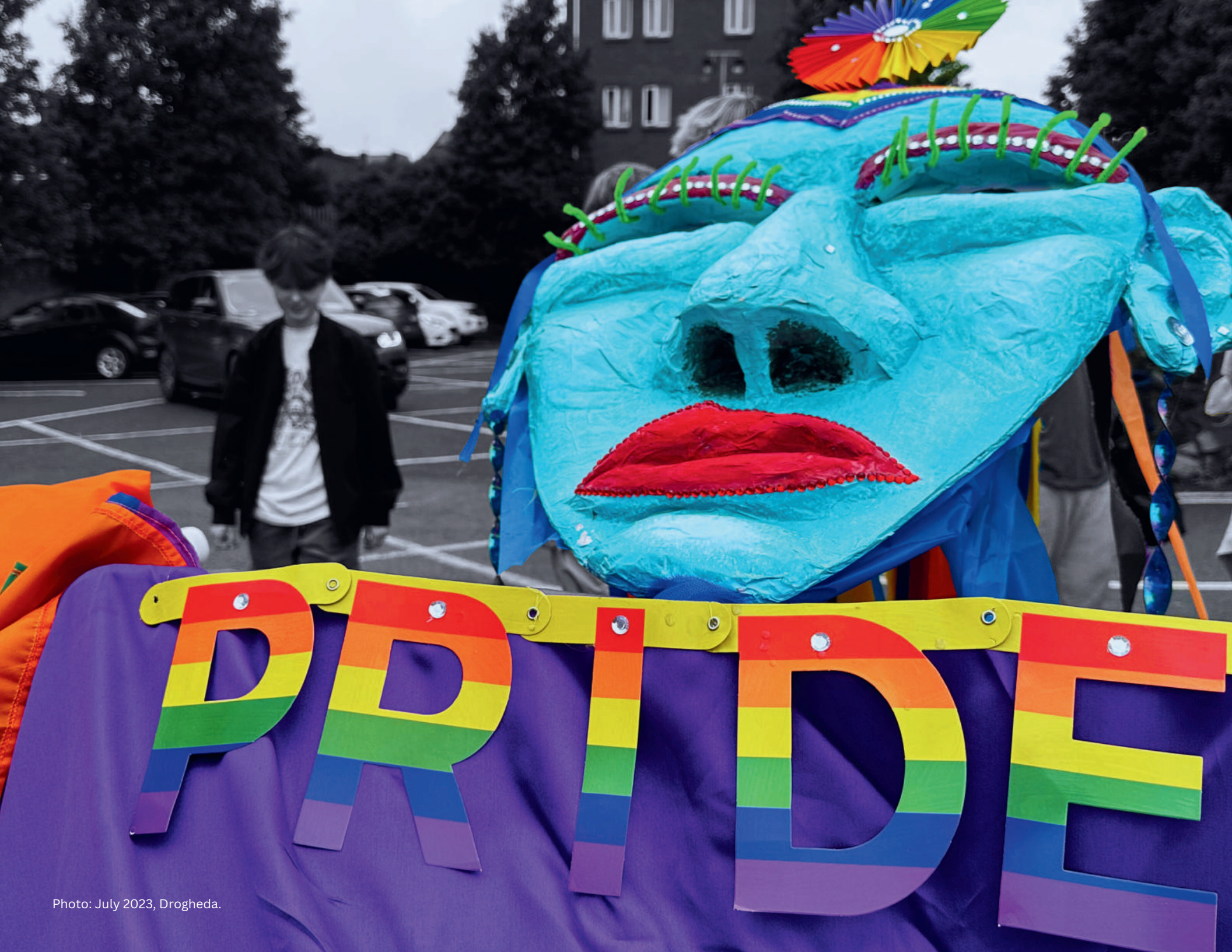
Photo: July 2023, Drogheda.