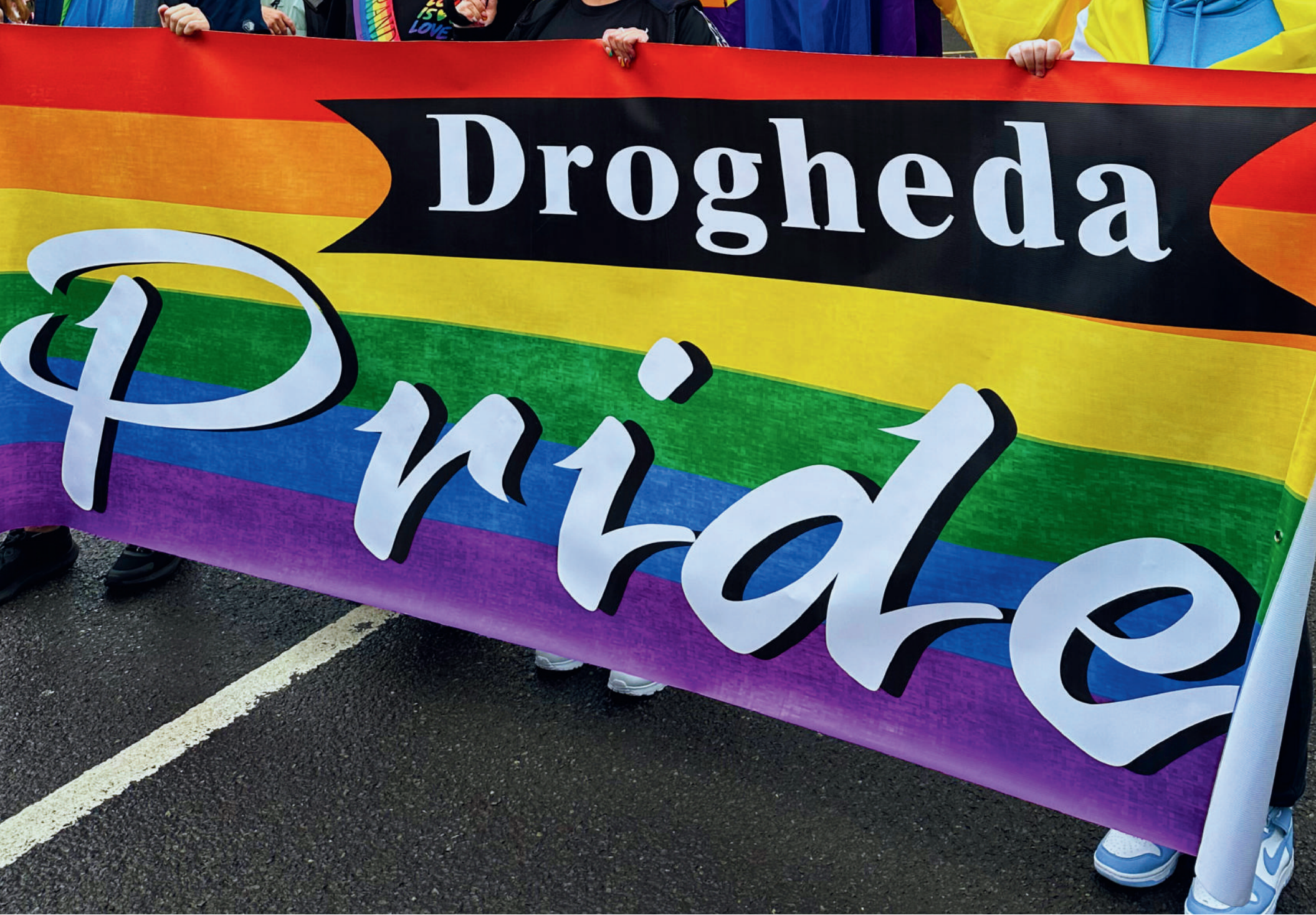
Photo: July 2023, Drogheda