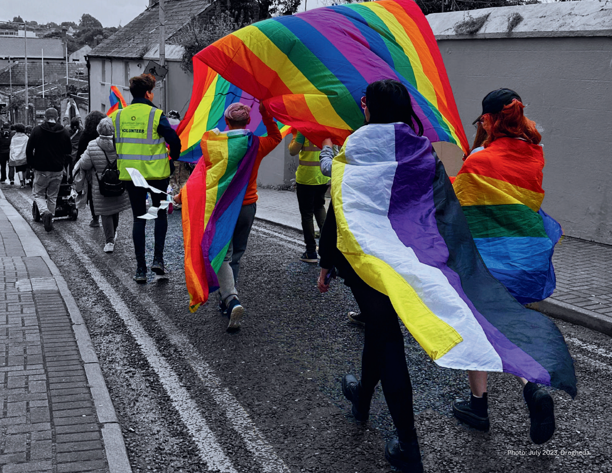
Photo: July 2023, Drogheda.