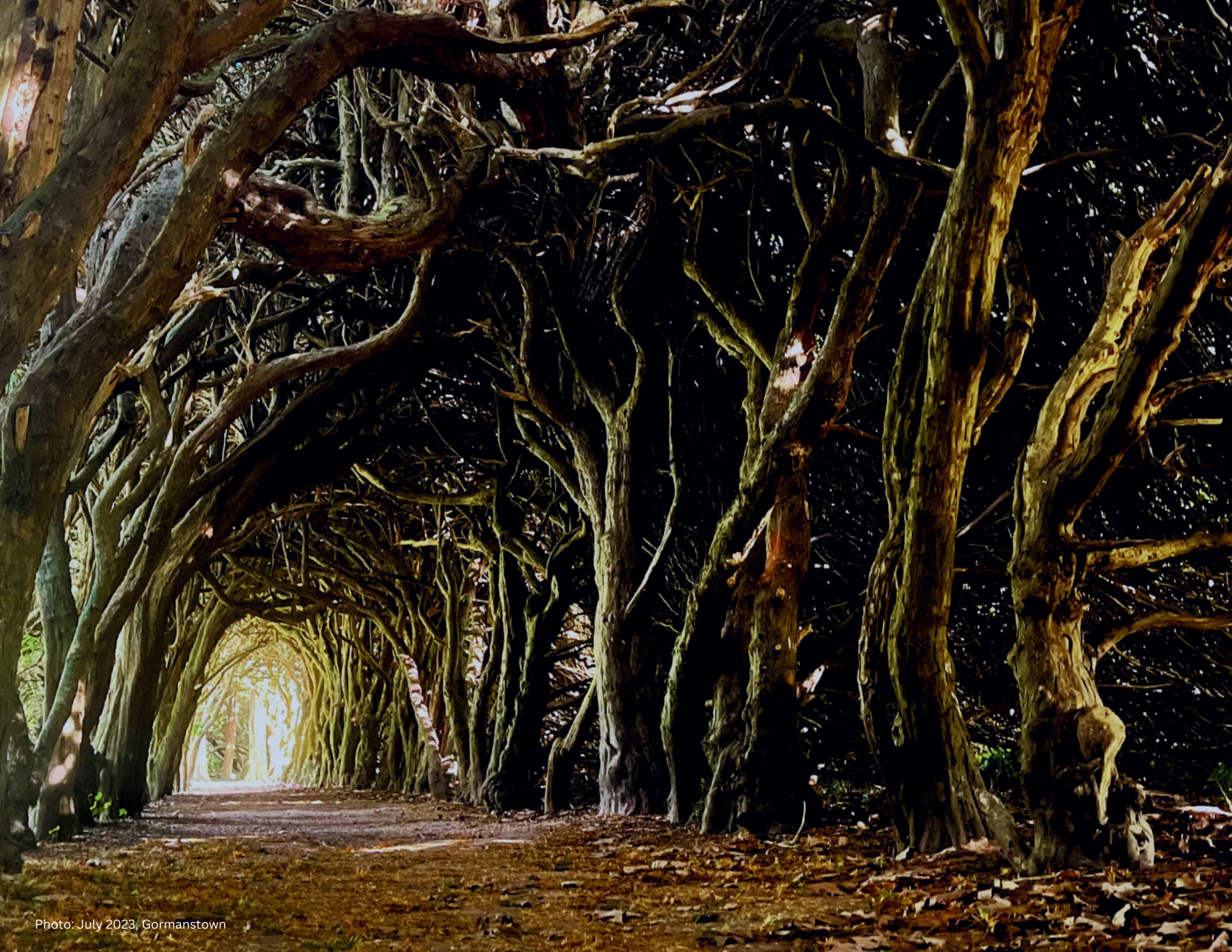
Photo: July 2023, Gormanstown